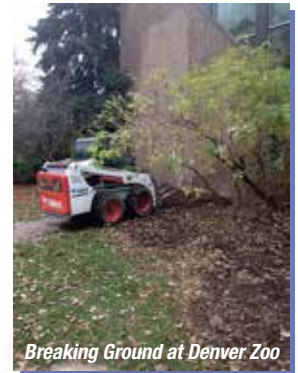
Breaking Ground at Denver Zoo

Work is underway at the site, with the Grand Opening coinciding with Pollinator Week from June 20-26. For all the latest updates, connect with Swingle and Denver Zoo on Facebook or Twitter.